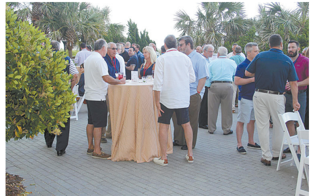
ESICA Associates meet to kick off the spring conference at the Cocktail Reception.