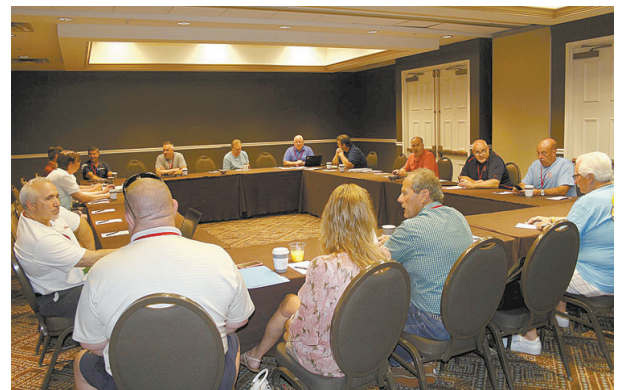
The conference offered many opportunities to meet with fellow professionals.