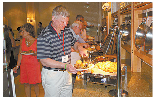
ESICA guests enjoyed wonderful entertainment and delicious food!