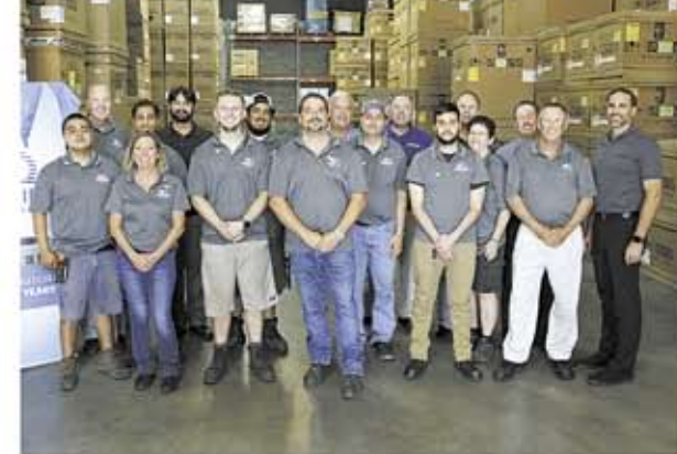
The corporate and local West Palm Beach Sales Center hosts